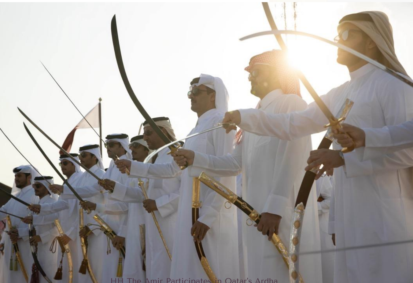
HH The Amir Participates in Qatar's Ardha