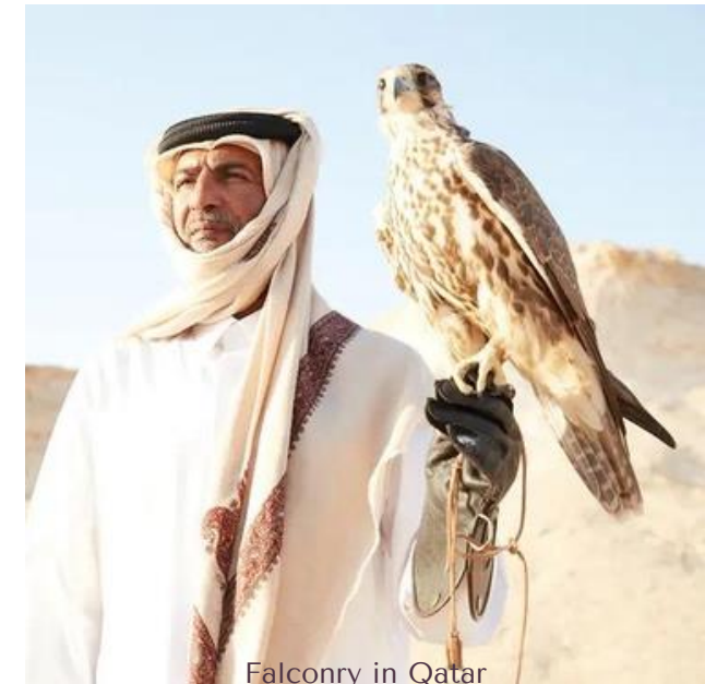
Falconry in Qatar